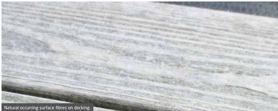
Natural occurring surface fibres on decking.

The higher the amount or intensity of UV the surface is subject to, the faster this process will develop. It should be noted that these fibres are formed on all exposed wood species, including Accoya®, particularly on flat surfaces like decking. A ribbed deck profile will tend to cause an accumulation of these fibres, making it all the more noticeable.