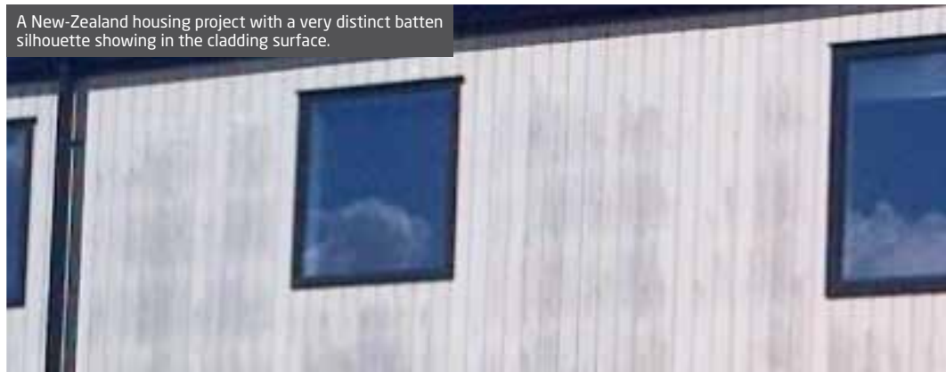
A New-Zealand housing project with a very distinct batten silhouette showing in the cladding surface.

For more information on deck cleaning, contact your sales representative for the relevant information sheet.