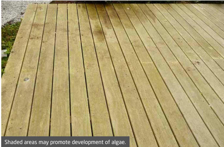
Shaded areas may promote development of algae.

Not only does this reflect on the appearance of a surface while drying, it will also have an influence on the development of moulds, algae and so on.