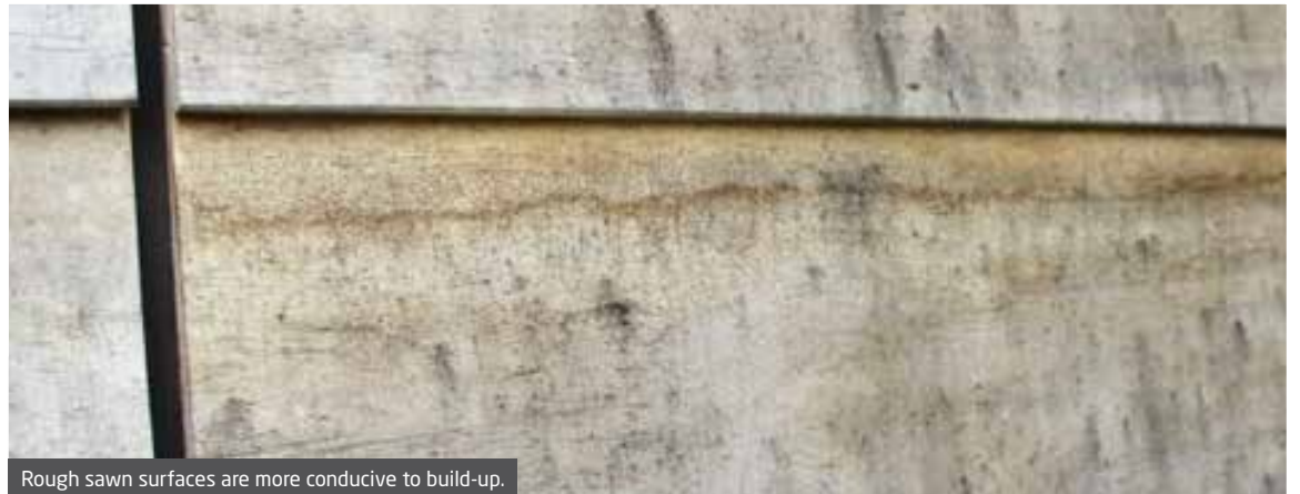
Rough sawn surfaces are more conducive to build-up.

While these surface growths do not cause decay themselves, they are often associated with the beginning of fungal decay of wood. However, on the non-toxic surface of Accoya® surface moulds may grow, but there will be no concurrent beginning of rot, that might affect its integrity.