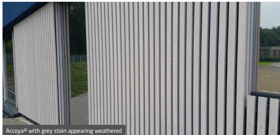
Accoya® with grey stain appearing weathered

Another measure to reduce risk of mould/yeast growth on and through coatings is the use of a thicker layer, as this will reduce moisture absorption. These film-forming coatings are typically appropriate for cladding. Sealing of board ends is common practice in the industry and will be very beneficial in achieving good results.